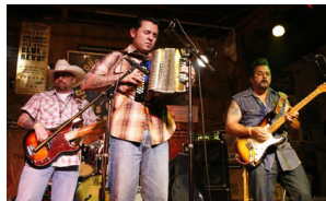
Los Fabulocos will play the Back Porch on Friday, May 17.