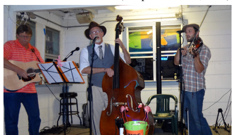
Bluegrass band Get Off the Lawn played Shorty's last Saturday night

I finished off the night at Shorty's with the Get Off the Lawn (Corpus Christi, TX)