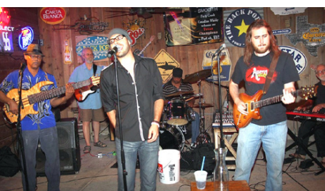
Austin Heat played the Back Porch last Friday night